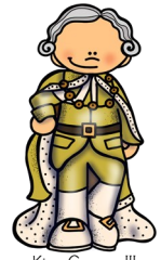
King George III