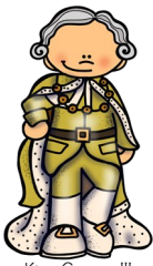
King George III