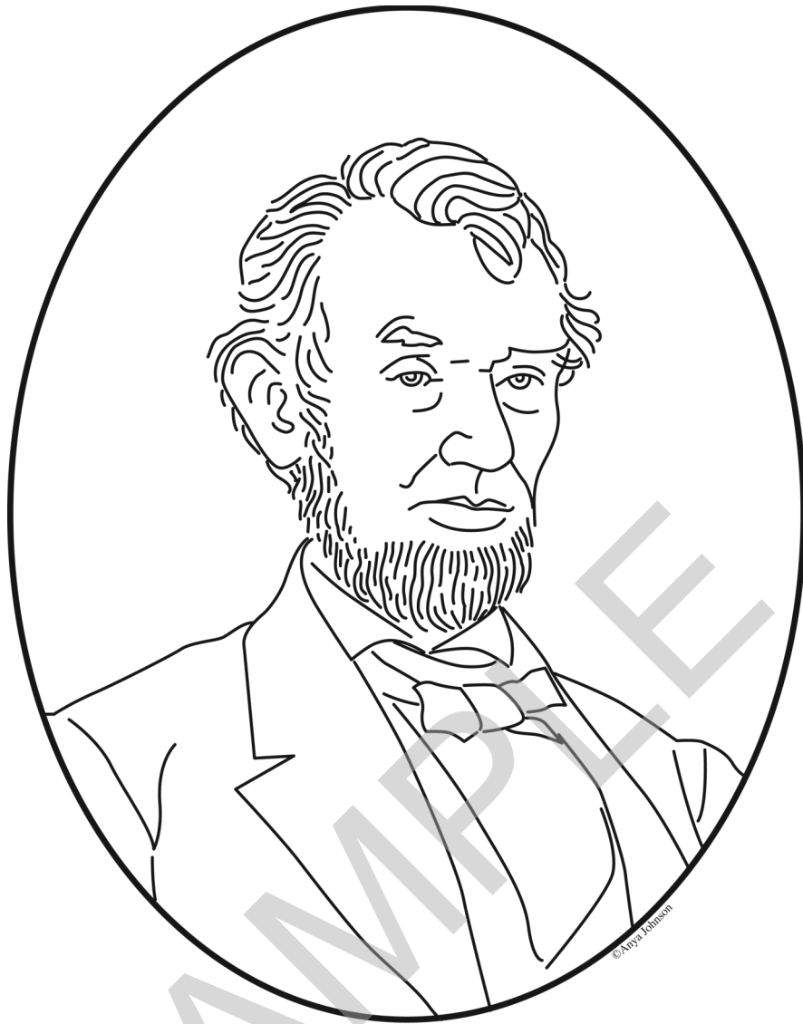
Abraham Lincoln, 1861-1865