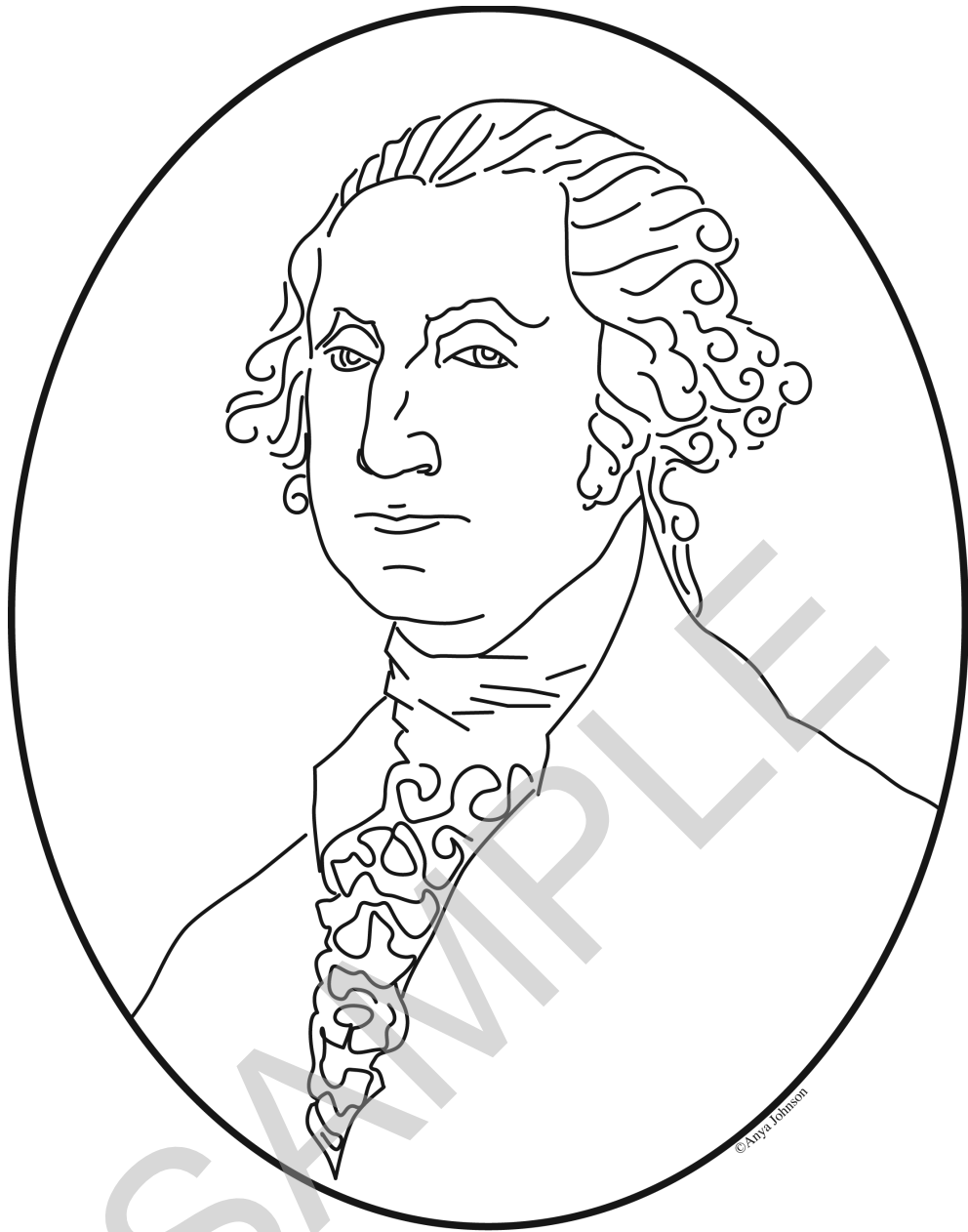
George Washington, 1789-1797

Washington fought to create a nation and became the first President.