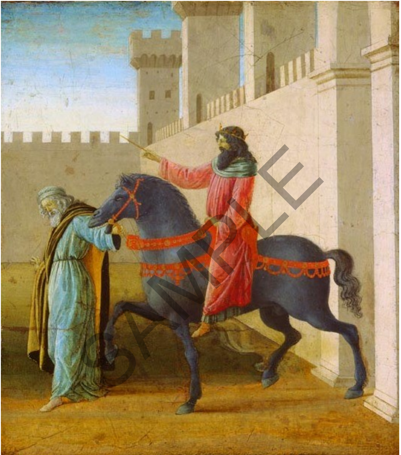
The Triumph of Mordecai by Sandro Botticelli