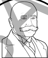
Ferdinand, Graf von Zeppelin