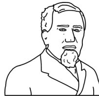
George M. Pullman